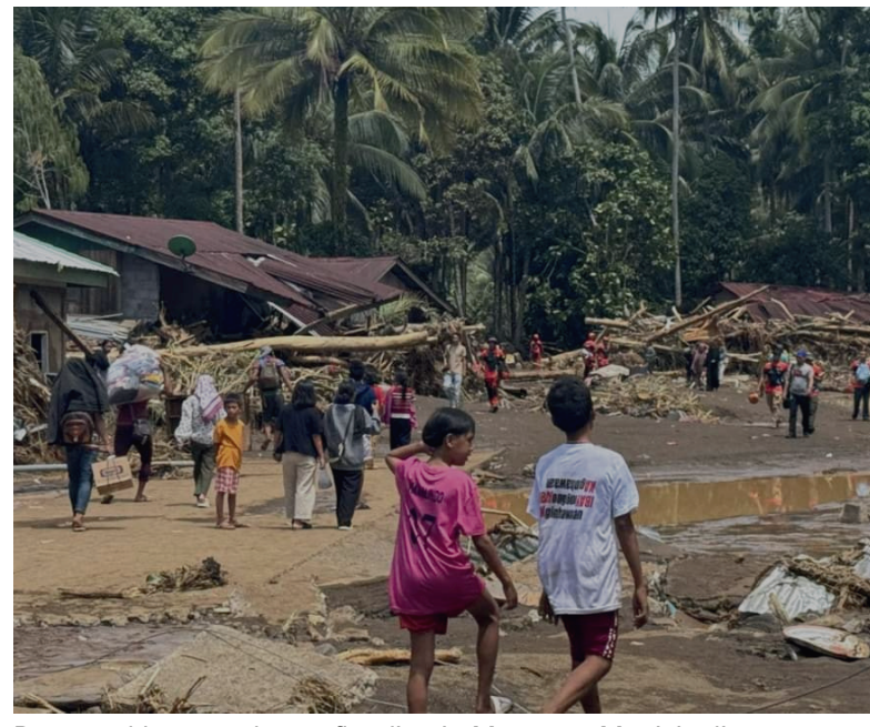
Damaged houses due to flooding in Matanog, Municipality province of Maguindanao del Norte, July 2024.