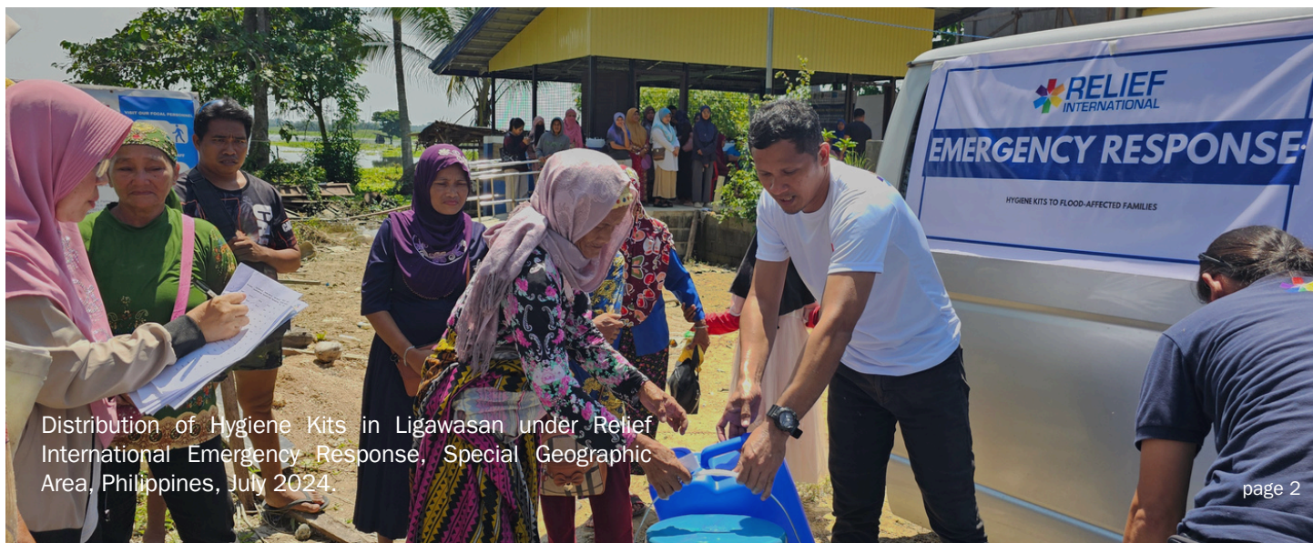
Distribution of Hygiene Kits in Ligawasan under Relief International Emergency Response, Special Geographic Area, Philippines, July 2024.

The Delpan Evacuation Center maintained adequate WASH facilities with additional portals, while the BASECO Evacuation Center faced water supply issues, leading to unflushed toilets and urinals. Generally, evacuees were in good health, though cases of skin infections and early-onset leptospirosis were treated promptly. Coughs and respiratory infections are being closely monitored due to cramped conditions. Food provisions were handled by local and national welfare offices, with additional support from officials and organizations. Flooding affected houses in three barangays, with significant damage reported in Barangays 649 and 20. Livelihoods, primarily blue-collar jobs, and small businesses were disrupted, necessitating cash assistance for recovery. Post-flood, most roads became passable, and debris clearing began. Communication remained stable due to good cellular coverage and accessible wi-fi hotspots in the highly urbanized City of Manila.