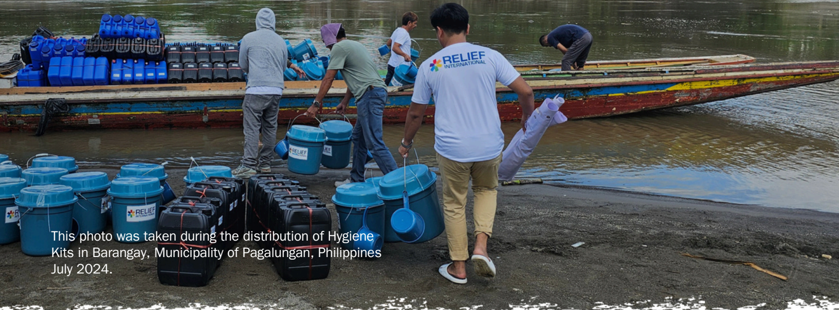
This photo was taken during the distribution of Hygiene Kits in Barangay, Municipality of Pagalungan, Philippines July 2024.