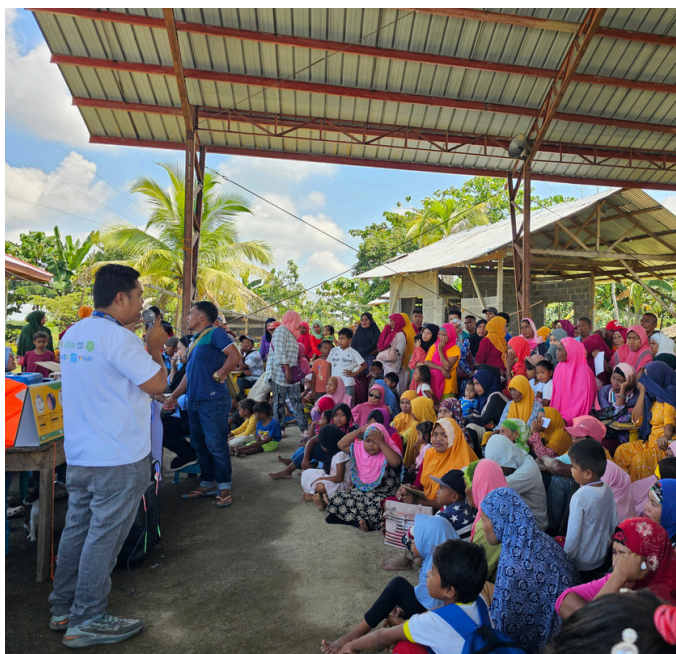
Hygiene Awareness Session in Ligawasan Special Geographic Area, Philippines, July 2024.