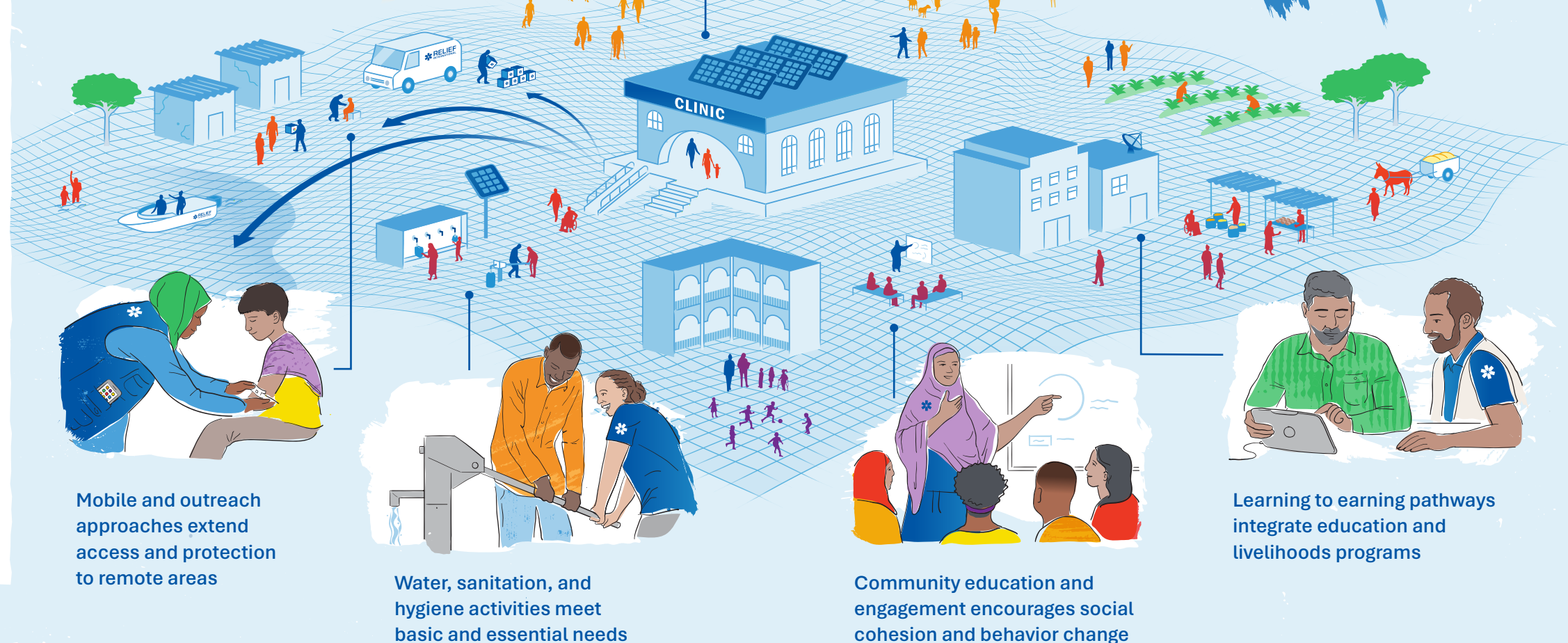
Mobile and outreach approaches extend access and protection to remote areas